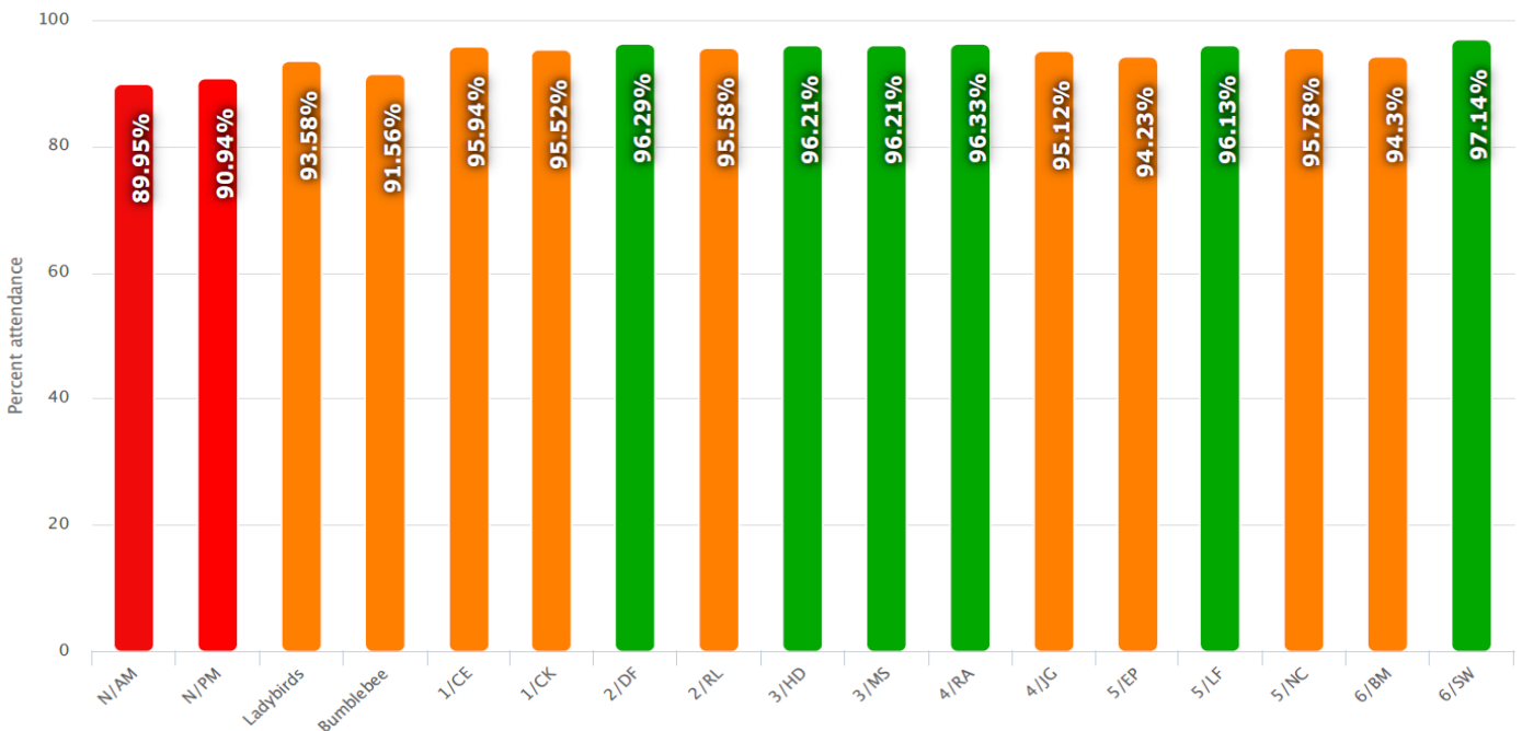
Attendance By Form between 27/08/2018 and 04/07/2019

We realise that from time to time it may be necessary for you to keep your child off from school. In order to record your child's absence correctly, we would ask that you advise the school by: