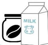
Drinks Coffee, Tea, Sugar, Long life milk, Squash

Please avoid donating perishable goods such as: bread, cakes, fresh or frozen produce.