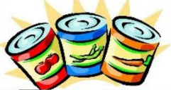
Tinned Food Fruit, Vegetables, Meat/Fish

Supporting over 100 families a week across Leicestershire