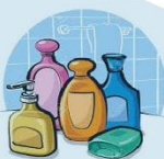
Toiletries Shampoo, Conditioner, Deodorant, Toothpaste