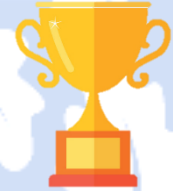
Attendance By Form between 27/08/2018 and 30/01/2019